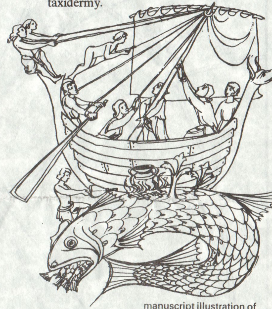
manuscript illustration of ship landing on a sleeping whale in mistake for an island